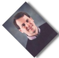
Figure 2—Image of the author scaled by 0.5 and rotated by 45°.

By default, JPEG files are included at a resolution of 100dpi so if you know