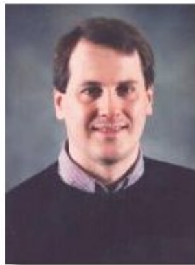
Figure 1—A JPEG image of the author.